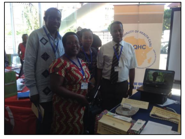
The East Africa team stands by their booth.