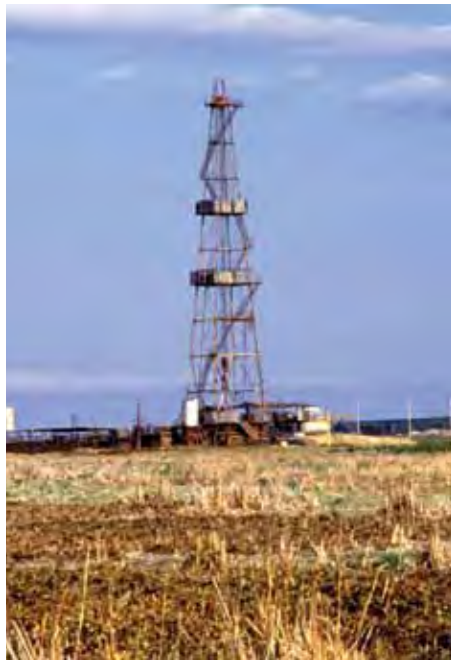
Anatoly Rakhimbayev/World Bank