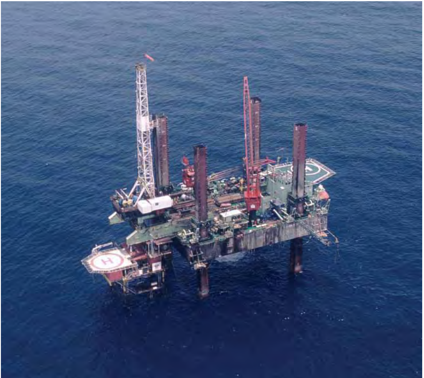
Curt Camermark, World Bank

shift in strategy. The expected increase in the numbers and roles of these companies – from junior mining companies scouring remote and sensitive locations for the next great discovery, to the foray of state companies from China and elsewhere into politically and environmentally controversial locales – challenges much of the progress made within the extractives sector in addressing sustainable development goals, addressing sources of corruption, mitigating environmental impacts, and addressing sources of social cleavage and conflict. USAID and other donors can play an important role in supporting industry progress in sustainable activities and promoting industry standards so that extraction activities deliver broad-based,