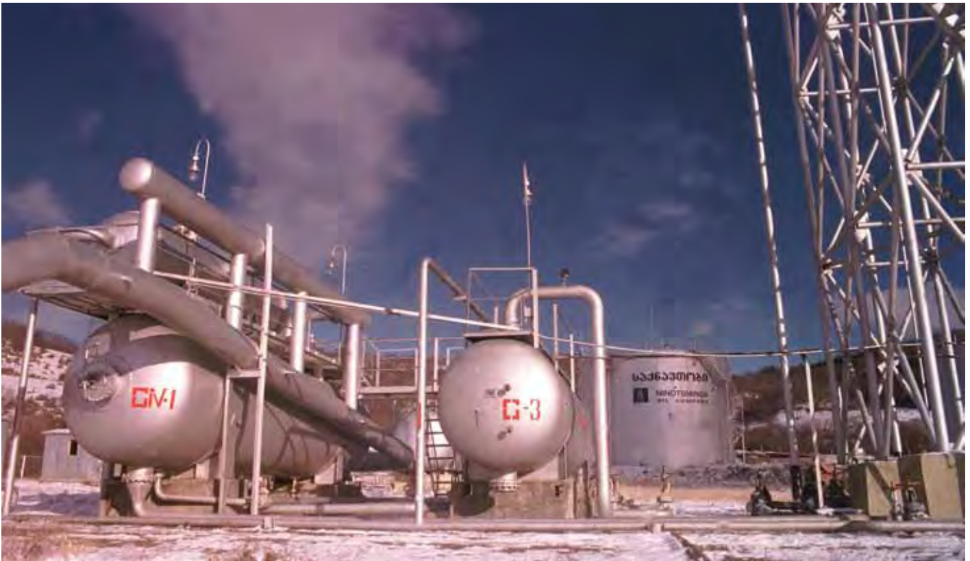
Yuri Mechtov/World Bank

sometimes look for assistance in designing sustainable development strategies to be supported by revenue from extractive projects. Particularly in Africa, USAID has a real opportunity, through partnerships, to help translate mineral wealth into raised standards of living and avoidance of the ‘resource curse.’