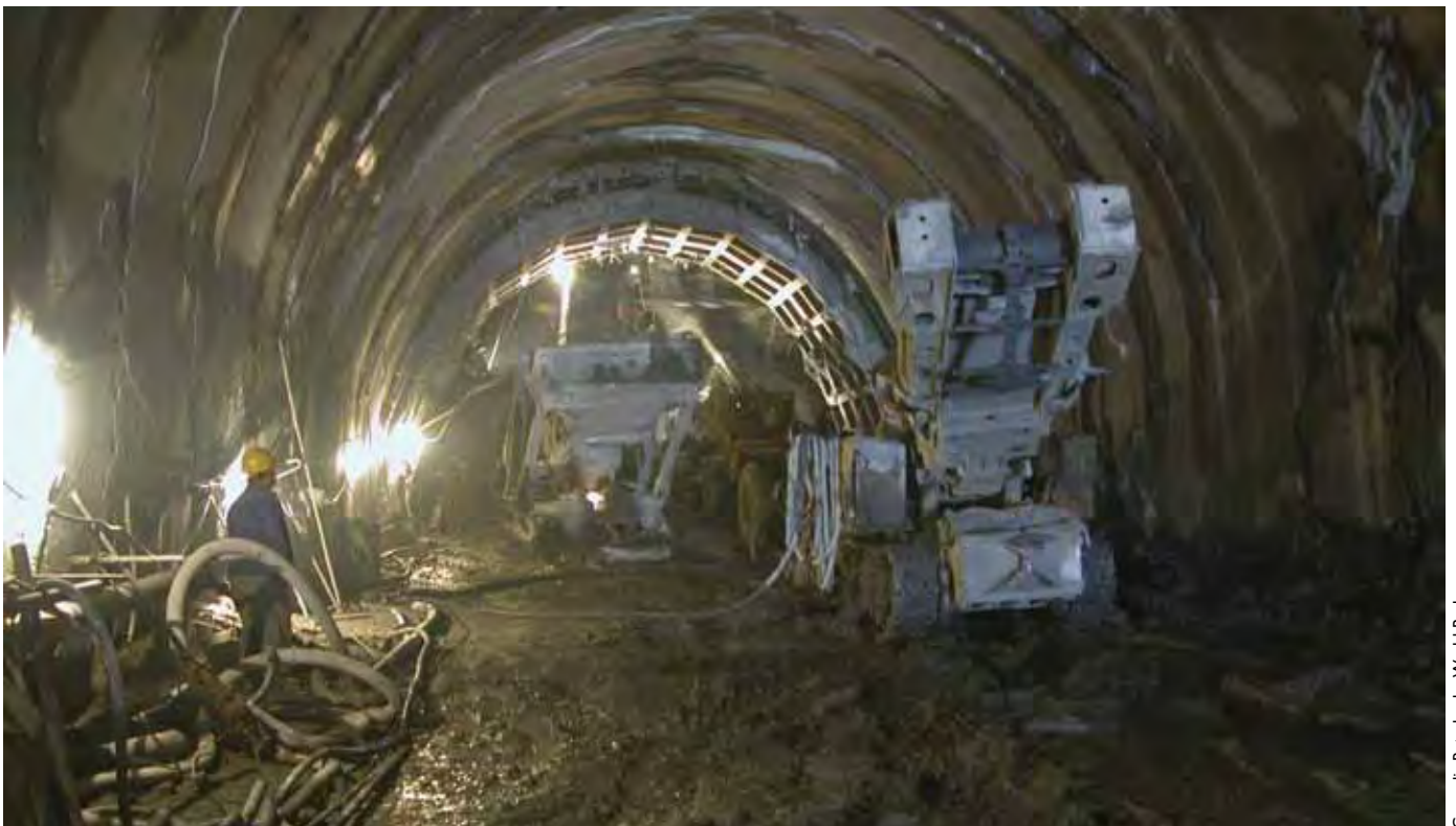
Genmady Ratushenko, World Bank