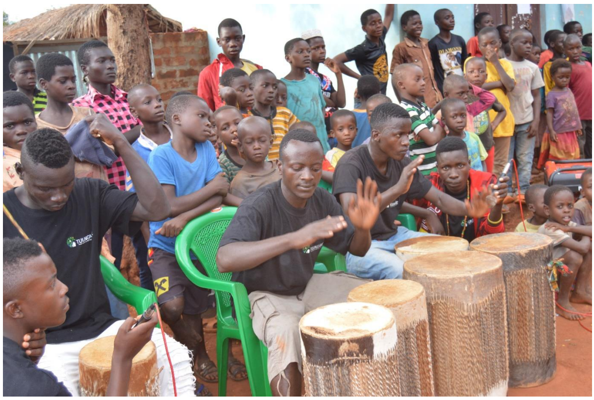
PHE drama group performing in the community.

The Tuungane Drama Group aims to not only raise awareness of threats to the Greater Mahale Ecosystem (GME), but also to encourage communities to actively participate and express their viewpoints on the PHE process. Since the project started applying drama techniques, a remarkable shift in the thinking and an increased trust by community members has been seen, they now more openly discuss issues from family planning to fish breeding sites protection.