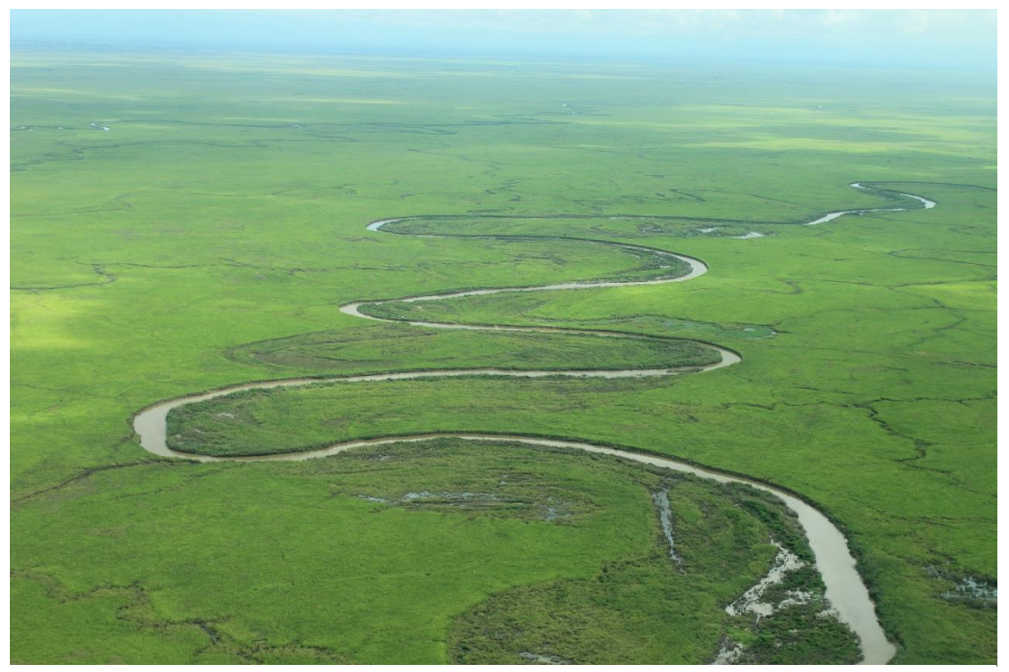
Kilombero Valley, Tanzania.