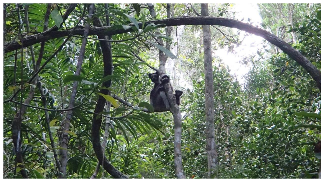
Indri indri is chosen to be the target species to be modeled for the land use.

A significant challenge in this project is securing quality spatial data to serve as scenario inputs. The vast scale of the region makes it difficult to secure comprehensive, representative datasets for features such as wide-ranging wildlife species. To compensate for specific conservation target data, we may have to use proxy datasets such as key biodiversity areas and ecosystems.