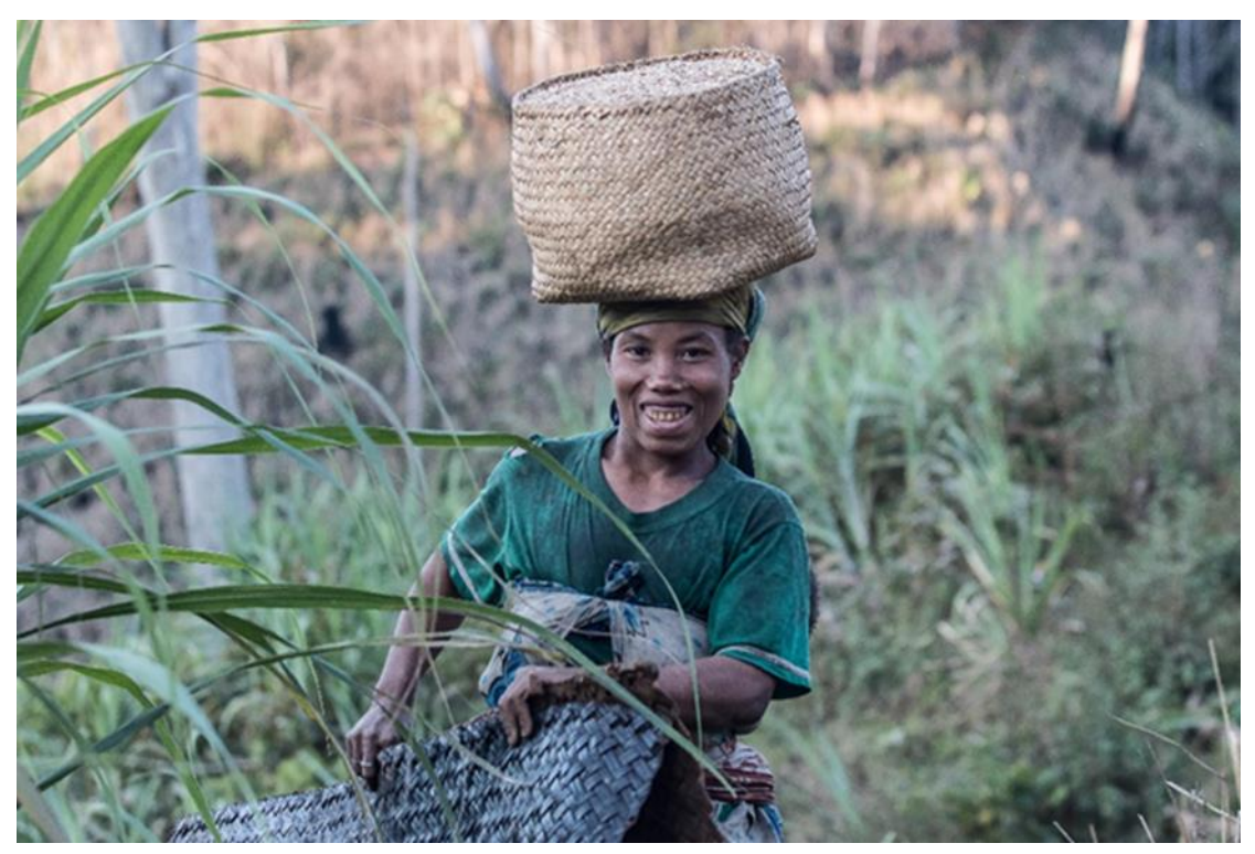
Unsustainable production, woman collecting her harvest from rain fed rice, Tavy in CAZ.

A field visit was conducted to identify which species are most important and be chosen as target species. Four species has been identified from this trip: Varecia variegata , Indri indri, Coua sp . Another ongoing trip is going to determine which species to monitor form the western part of CAZ.