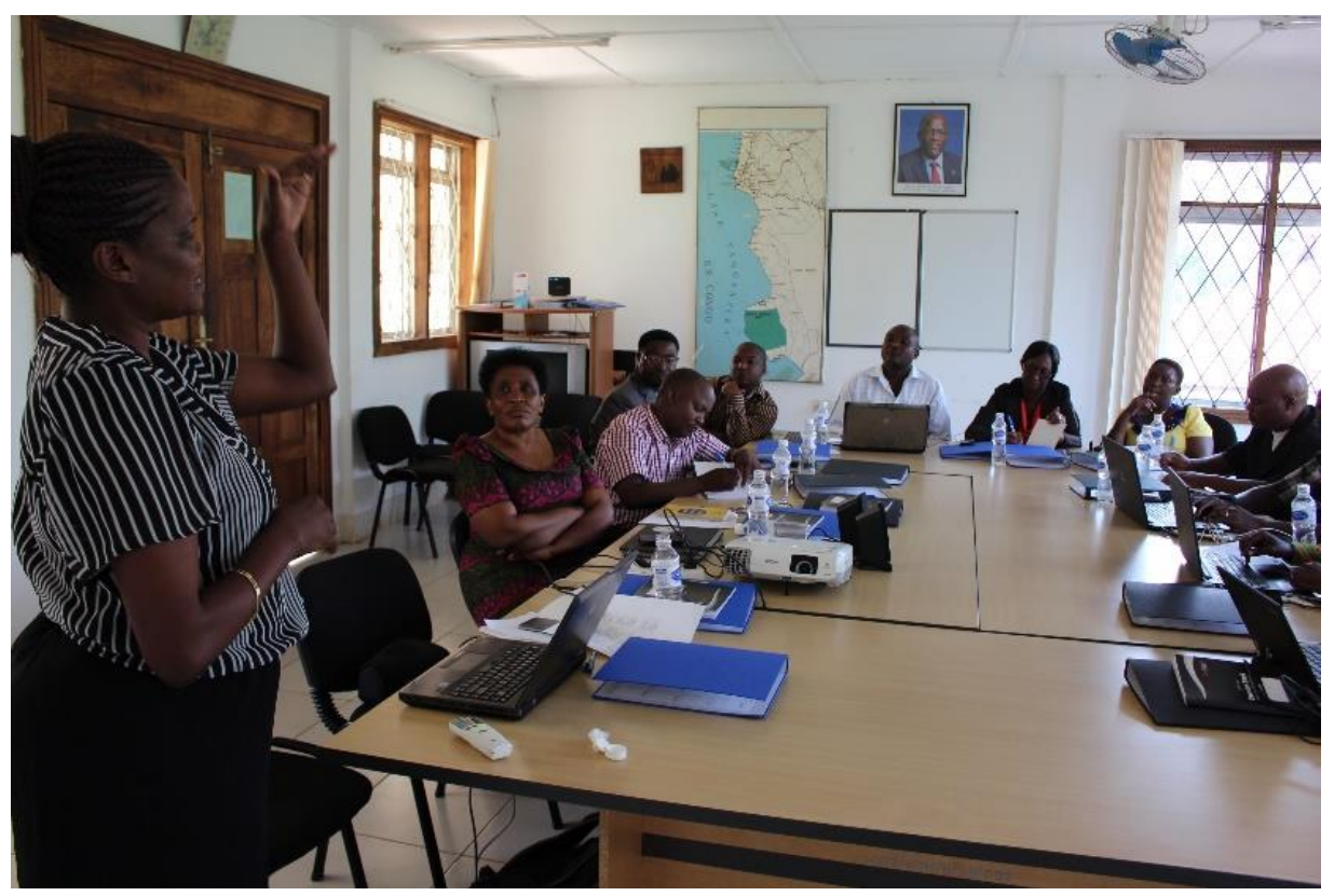
Workshop held from October 25-26, 2016 at the JGI-Educational Center in Kigoma, Tanzania.