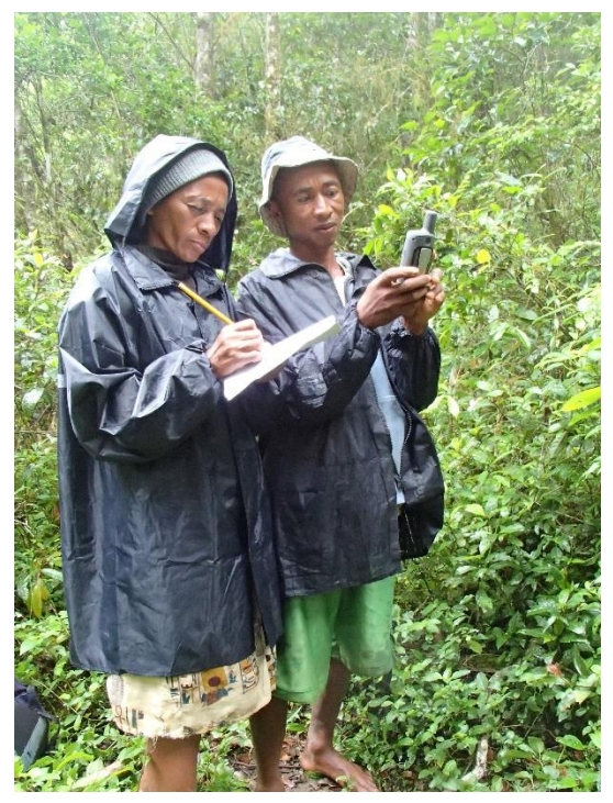
Members of the Community based Association Vonona from the Corridor Ankeniheny Zahamena performing a periodic patrolling.

A few workshops have been planned to: 1) Identify data gaps and find sources, and 2) Design the data collection and update. One of these workshops will be held in Toamasina on April 23^{rd} - 25^{th} and a second workshop in Ambatondrazaka on May 2^{nd} - 5^{th} . The outcome of these workshops will be a clear roadmap on data analysis and parameters to use on the scenario modelling.