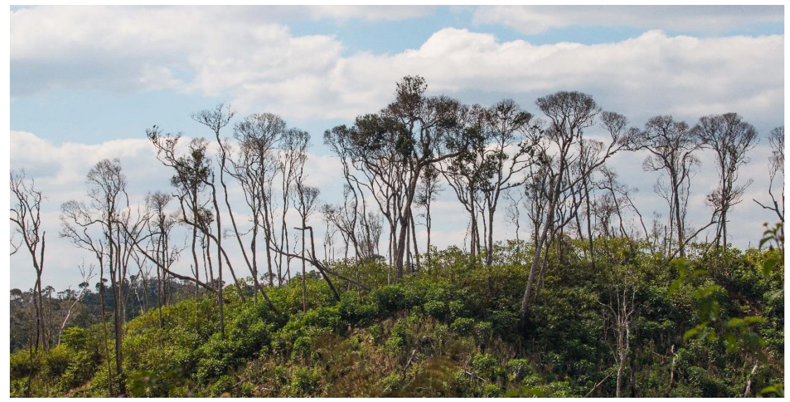
The forest after one cycle of tavy. Most of the tree has died.