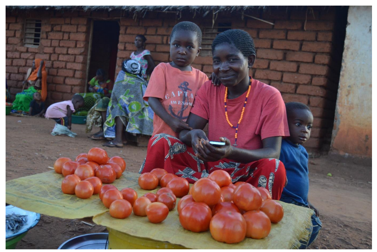
Adolescent mothers at market place after a preliminary training on entrepreneurship, Tuugane Tanzania.