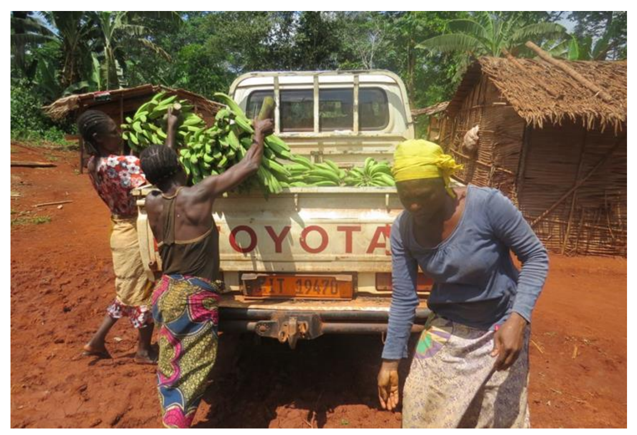
Strengthening women's capacities and harvesting plantain in the community farm of Mambele village, Cameroon.

The second lesson learned is the types of activities that facilitate community involvement in natural resource management. Indeed, current activities that allow communities to follow best practices in children's diets are a source of admiration. Also, women who have had the chance to visit the Park with a local guide (visits arranged by the project) and learn new things have an increasingly positive outlook about the benefits that the Park can bring them and the reasons for its protection.