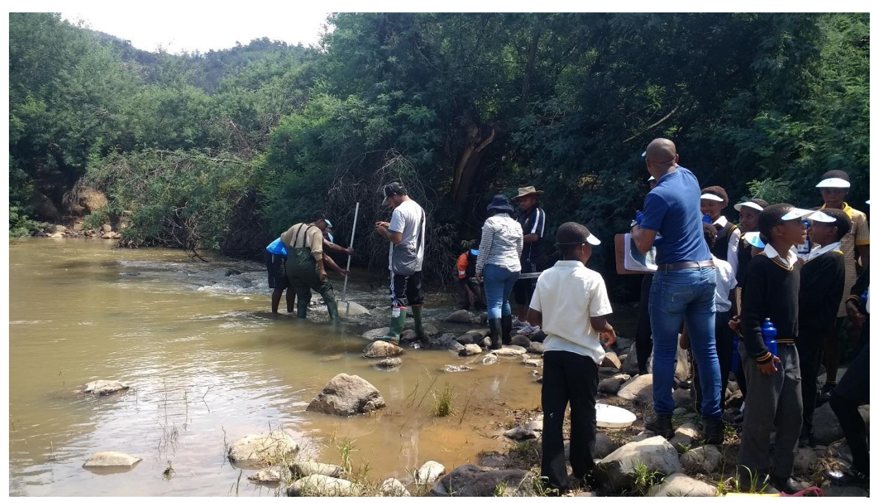
CSA and ANDM partners show school children how to conduct a river health assessment and see impacts of land uses and invasive species on water resources during national Water Week. Eastern Cape, South Africa.