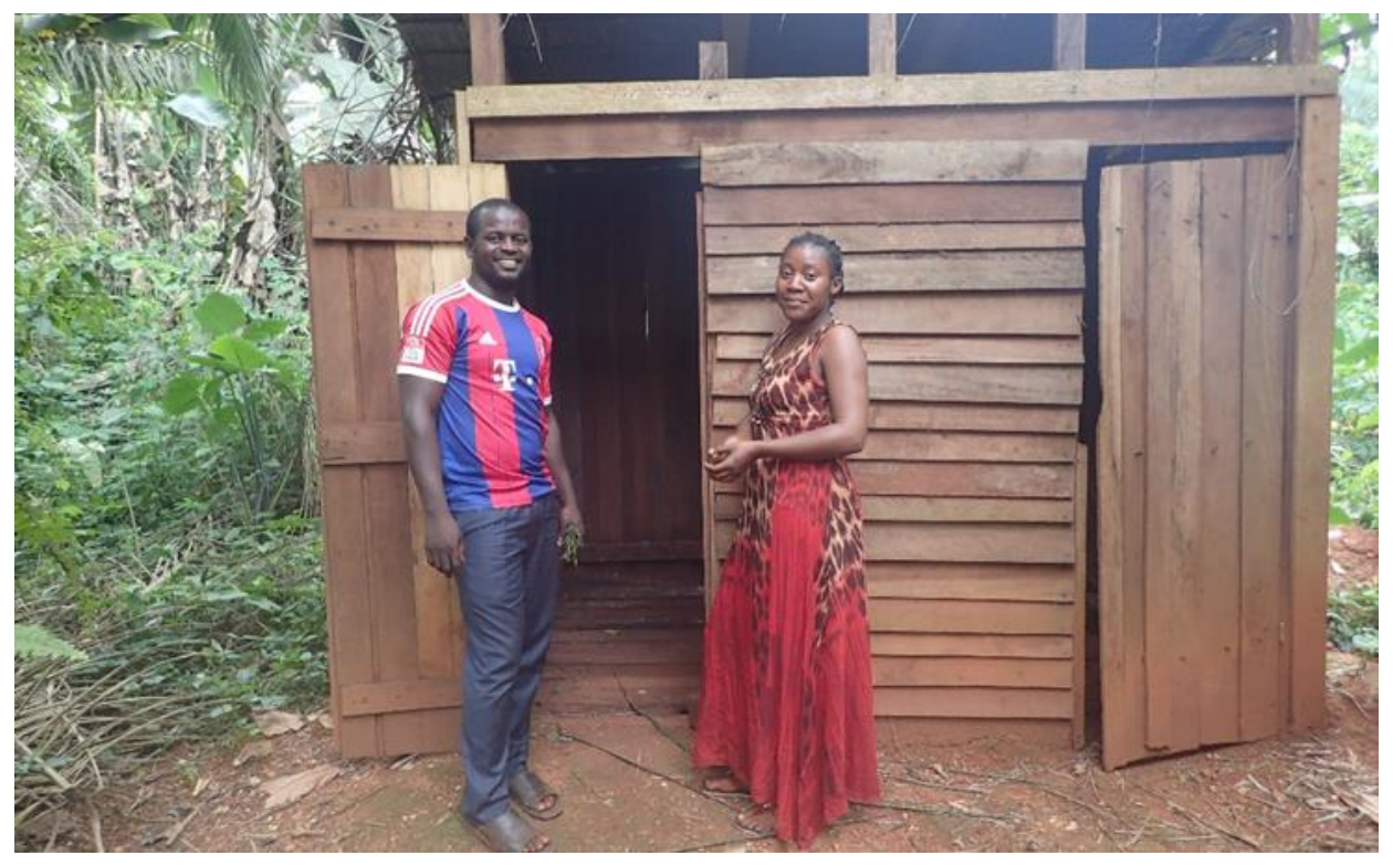
Example of a latrine constructed at household level by community members with technical support from health scouts.