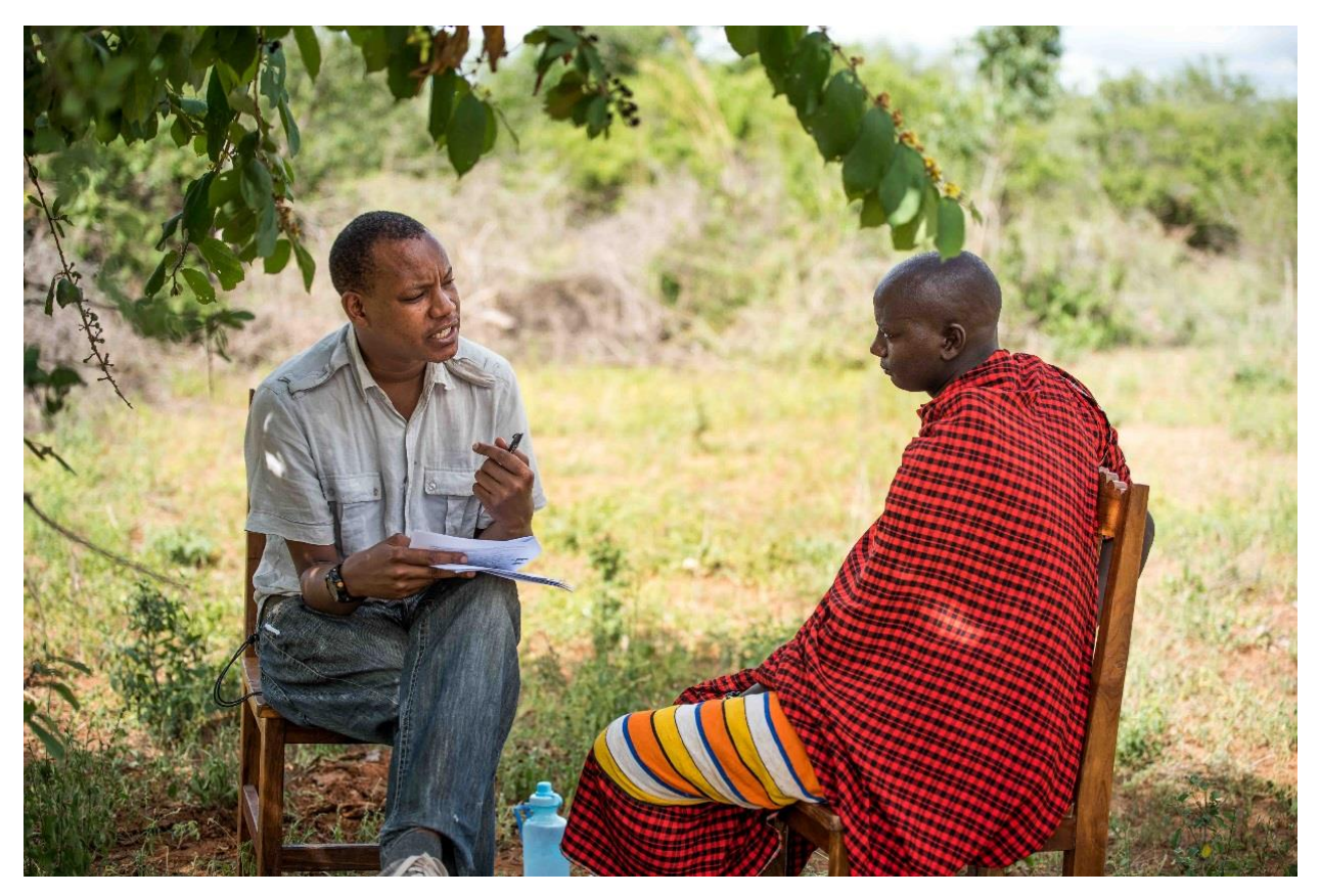
Human response survey, Makame, Tanzania.

Through partnerships with local organizations (WRI partnered with Centro Terra Viva in Mozambique and WWF partnered with the Integrated Rural Development and Nature Conservation in Namibia), a number of field staff have received training in best practices for interview methodology, as well as increased knowledge on climate impacts.