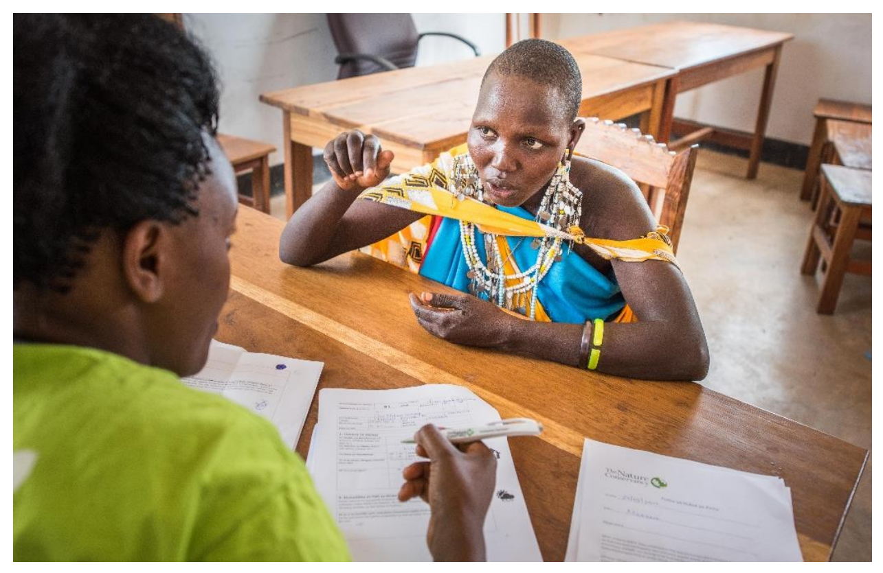
Human response survey, Makame, Tanzania.