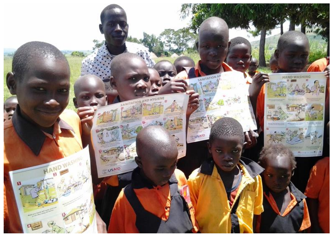
WASH sensitization posters developed for dissemination in schools and community gathering areas. Masindi, Uganda.

A key lesson for JGI was that the effectiveness of by-laws to demonstrate how initiatives that build community management of the environment are best administered at the local level. The by-laws are also critical in enhancing the decision-making processes because of the inclusive participation of local stakeholders in their enactment, monitoring and enforcement of WASH activities.