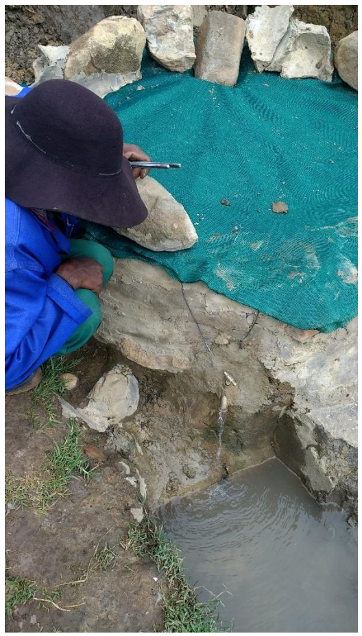
Water monitor volunteer taking water quality measurements at a rehabilitated spring. Eastern Cape, South Africa.

women and 15 unidentified<sup>3</sup>) in CSA's pilot sites. CSA will begin to incorporate health data through the establishment of a Health Protocol. CSA hired a consultant to design the protocol and health data collection began in March 2017.