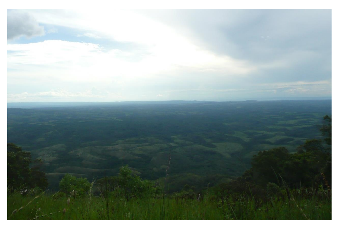
Kabobo Wildlife Reserve, DRC.

The LRTR working group is developing and testing strategies and tools that place greater land and resource management authority in the hands of local resource users, thus creating incentives for them to exercise their authority in ways that are consistent with biodiversity