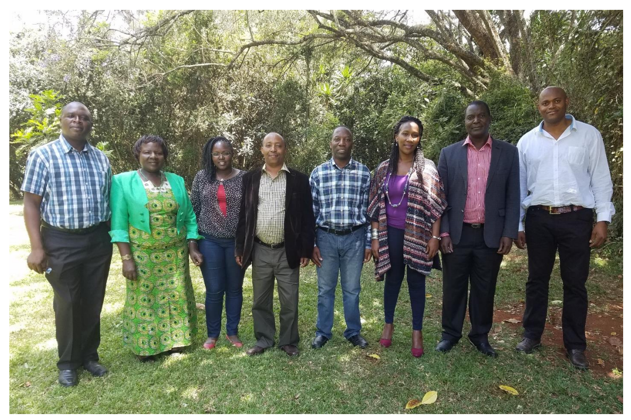
Inaugural meeting participants for the Nairobi-based Community of Practice. Nairobi, Kenya.

Created and shared a <u>guidance note</u> on the LinkedIn Groups online platform with the 13 CoP participants.