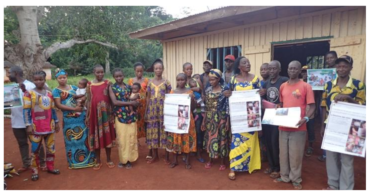
Sensitization of women and men on good child nutrition practices and clinical signs of malnutrition.