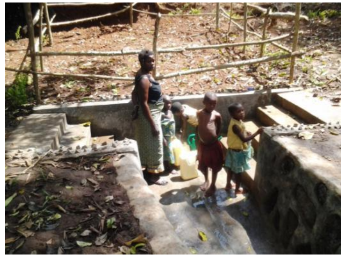
In Siiba Village, Budongo Sub County, Masindi, UGANDA, women and girl children are still playing a leading role in fetching water.

Men are now slowly getting involved in fetching water due, in part, to improved water access points. Fetching water has typically been women's and children's roles in the project area, as shown in the gender analysis prior to water source protection efforts.