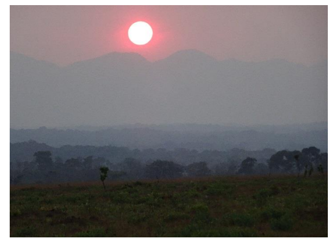
Kababo National Park, DRC.

The LRTR working group is developing and testing strategies and tools that place greater land and resource management authority in the hands of local resource users, thus creating incentives for them to exercise their authority in ways that are consistent with biodiversity conservation and sustainable use of renewable resources. The task members are piloting new approaches for securing tenure in three critical ecosystems: Greater Mahale Ecosystem, Tanzania (TNC, JGI); Kilombero Valley, Tanzania (AWF, WRI); and Kabobo Reserve, DRC (WCS, WWF). These ecosystems are anchors for biodiversity that support livelihoods for growing local populations. Strengthening rights and securing tenure,