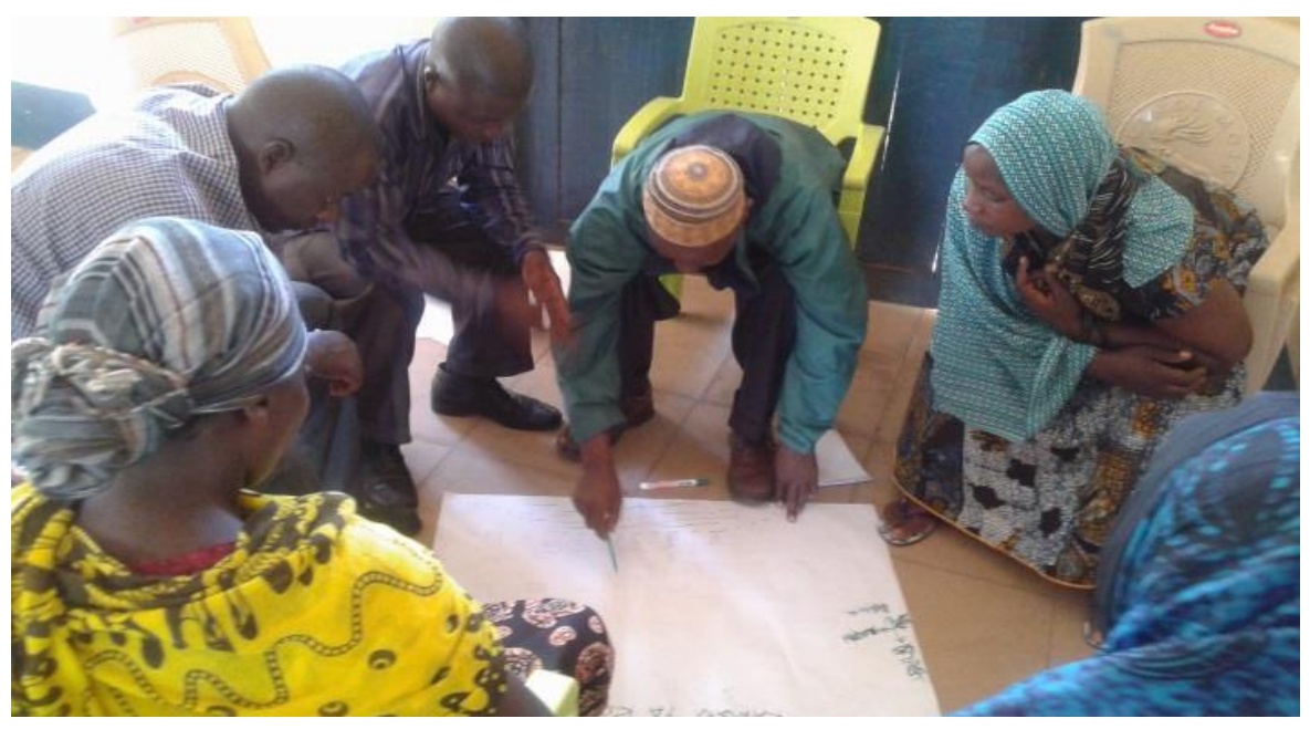
Participants mapping resources within their village during model household motivator training.