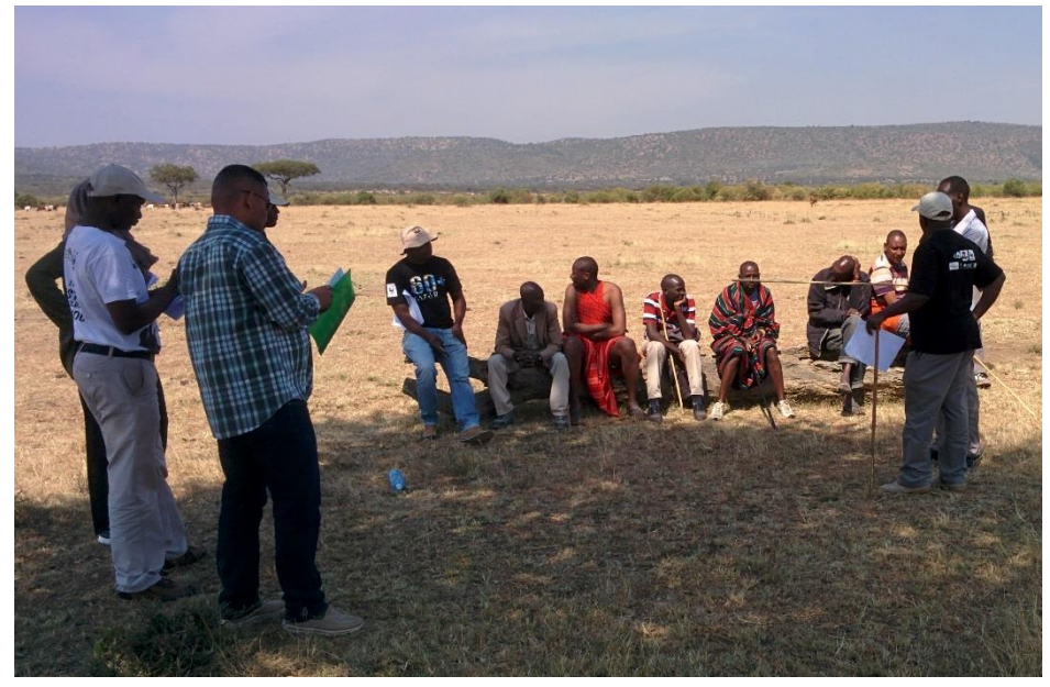
Community interview, Maasai Mara, Kenya.

Kenya: Masaai Mara (August 2016) Zambia: Sesheke (November 2016) Zimbabwe: Hwange NP (January 2017)