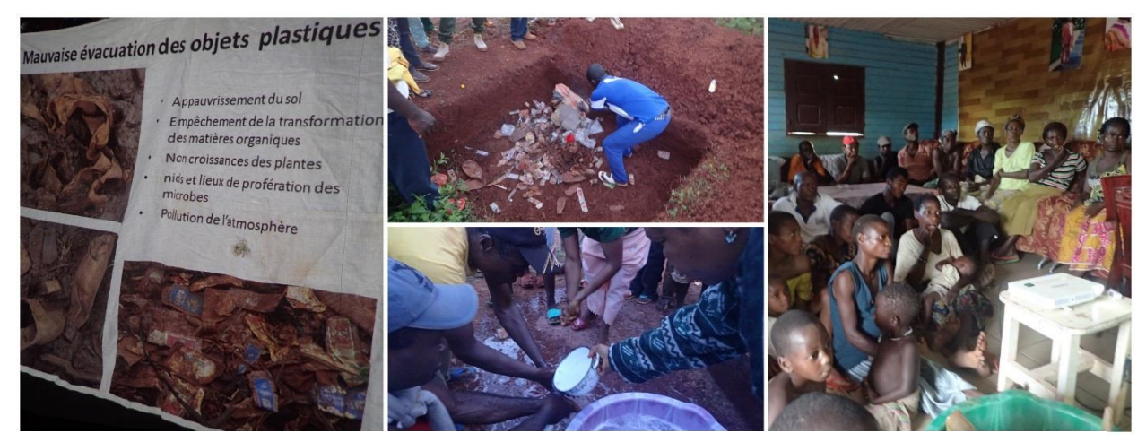
From left to right: an example of a slide relating to garbage disposal (1), a garbage pit dug to raise awareness (2), proper hand washing demonstration (3) and people attending a sensitization meeting (4).

authorities and four managers of health facilities significantly contributed to the smooth running of the various activities.