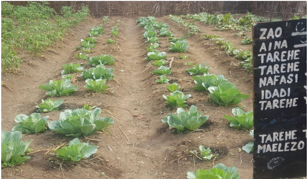
Some of the crops grown at demonstration plots where FFS sessions are conducted at Mgambo village, Tanzania.