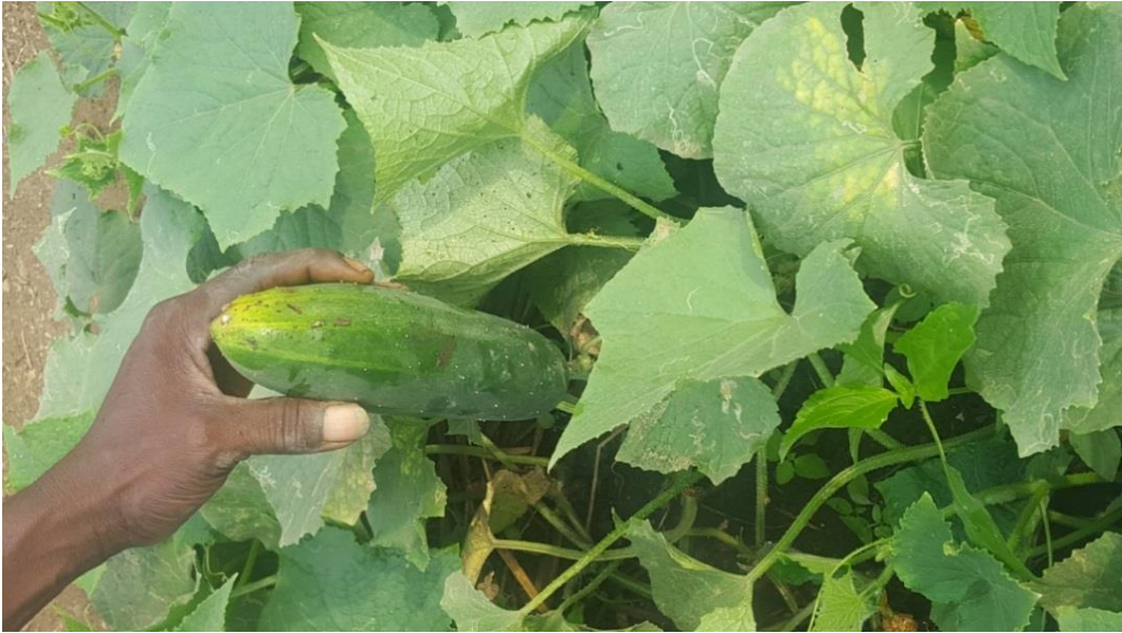
Cucumber fruit in one of the demonstration plots operated by Tuungane program at Mgambo village, Tanzania.