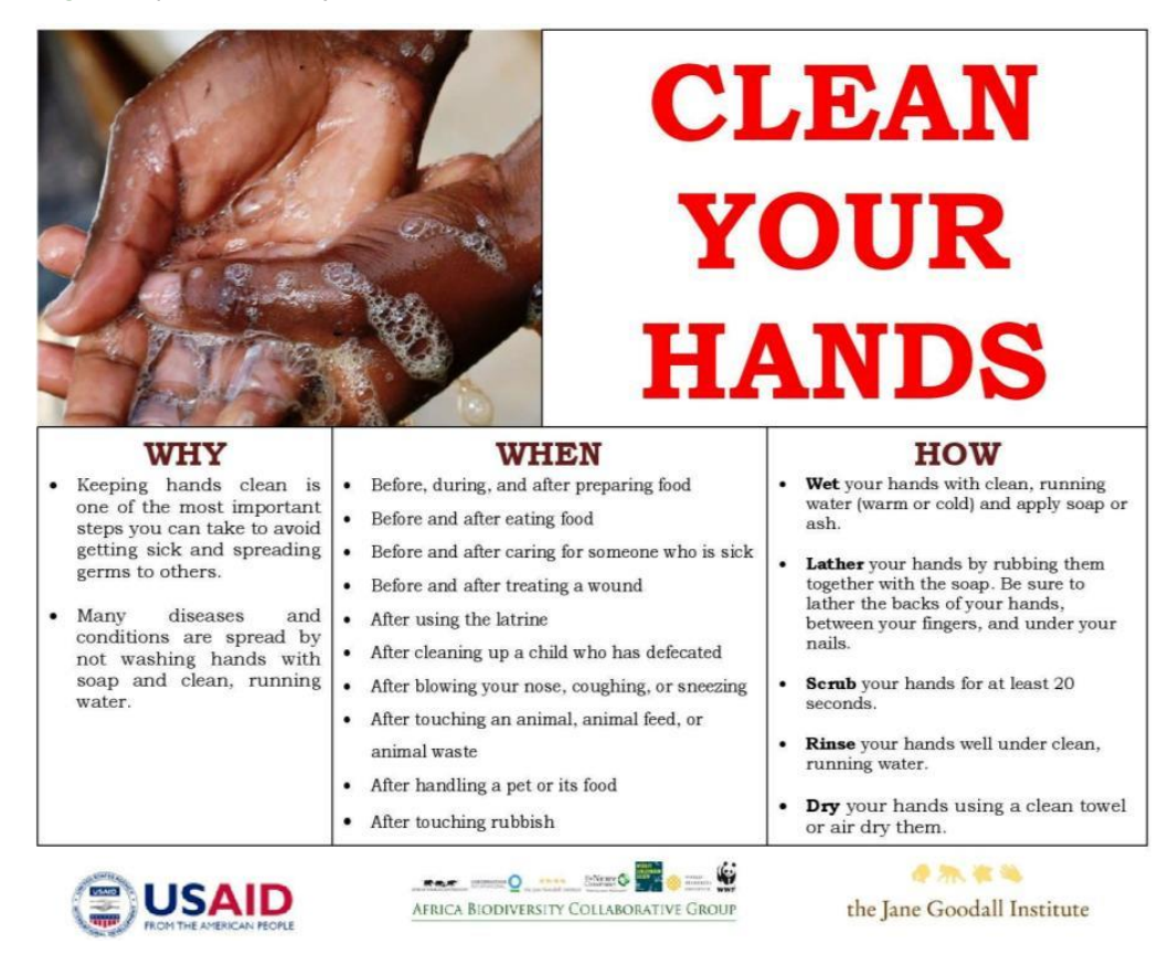
Figure 2 | WASH best practices fact sheet

Awareness materials on WASH best practices have been developed (Figure 2).