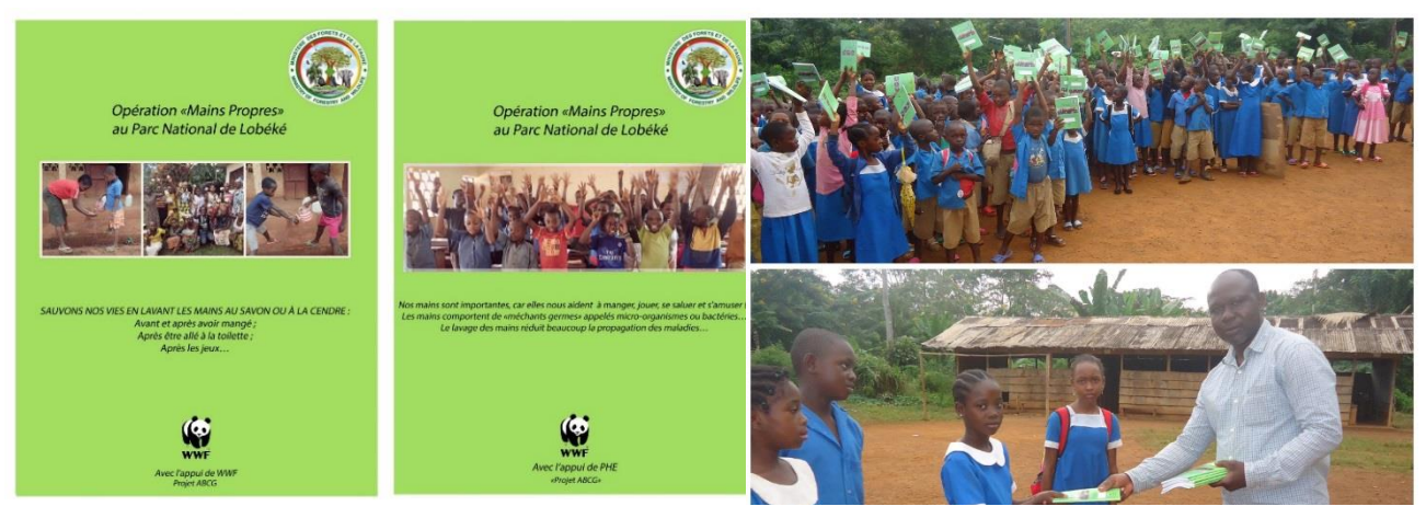
From left to right: Example of the first and fourth grade cover notebooks (1 & 2) and an example in the distribution of the handwashing awareness notebooks for students (3 & 4).

In order to build on the proper hand-washing practice campaign that has taken place from previous years in the project area (school-based FW-WASH project with funding from Johnson & Johnson and the Borrego Foundation) we rallied students around the slogan: "The Clean Hands Operation at the Lobéké National Park". Therefore, we produced 4,500 student notebooks and 500 notepads containing highlighted integrated messages on hygiene, sanitation and the environment, which focus on the importance of hand washing, the dangers of poor hand washing practices, how to protect the environment, and the well-being benefits of hygiene and health. According to the headmaster of the Moloundou high school, these notebooks are very efficient as a teaching tool, because students learn good hygiene practices while simultaneously learning to read. Books were distributed to over 60% of students in 30 schools and colleges in the project area.