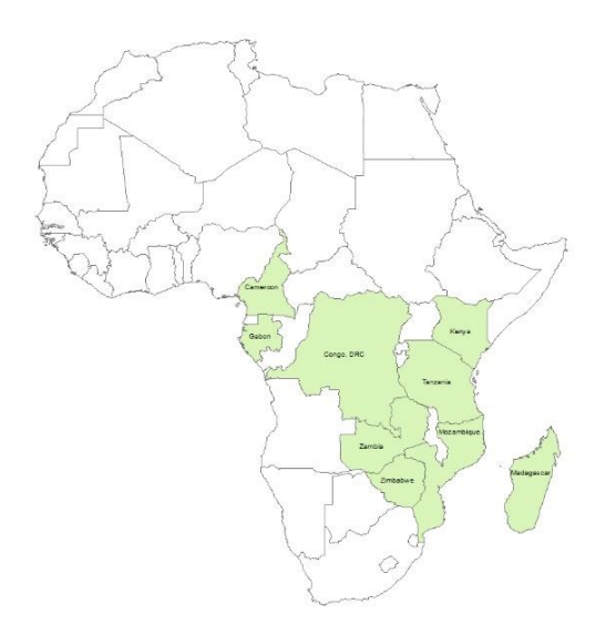
Figure 1 | Nine countries where community surveys on human responses to climate change and subsequent impacts on biodiversity are being administered

TNC has conducted the contemporary climate analysis for the nine countries where the human response field surveys are being conducted. The results are currently being analyzed, summarized, and mapped in preparation for the climate impact assessment report by December 2016. TNC has also conducted a future projected climate analysis for the 9 countries where the human response field surveys are being conducted. The results are currently being analyzed, summarized and mapped in preparation for the climate impact assessment report by December 2016.