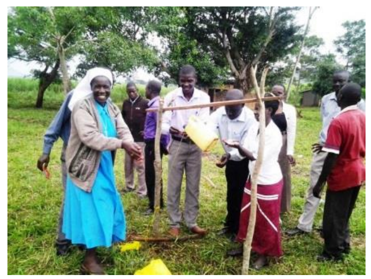
Teachers demonstrating the use of a tip tap after the ABCG – WASH training.