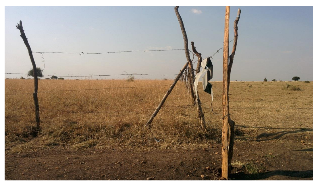
Rangeland retention, Maasai Mara, Kenya.

The key achievement to-date is the development of the survey instrument to investigate human responses to climate change. This tool is the product of field testing during the ABCG I funding cycle, analysis of those results, further refinement, pilot field testing, and eventually review by an Institutional Review Board. A number of survey methods exist for investigating the impacts of climate change on communities, but none allow investigation of impacts to biodiversity. This survey therefore represents a novel tool that should have wide application well beyond ABCG partners.