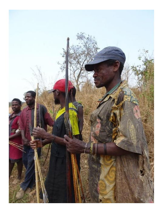
Batawa hunters, DRC.

During the development of the Conservation Action Plan (CAP) for the Kabobo-Luama Landscape, stakeholders identified a need for the establishment of a local board (CLG, comité locale de gestion) to ensure local involvement in the management of the proposed Kabobo National Park. In May 2016, the CLG was established and included traditional chiefs, civil society, the Forestry Department and the local administration. Members of the CLG signed an agreement which was filed with the Territorial Administrator for legalization. WCS advocated for a more inclusive committee, bringing in women, indigenous people, and general community members to the second meeting of the CLG in August 2016 where the committee created three seats to improve its inclusiveness. In early September, the CLG visited the field to assess the level of human impacts on biodiversity. This visit catalyzed the Provincial government to speed up political steps to establish the Provincial