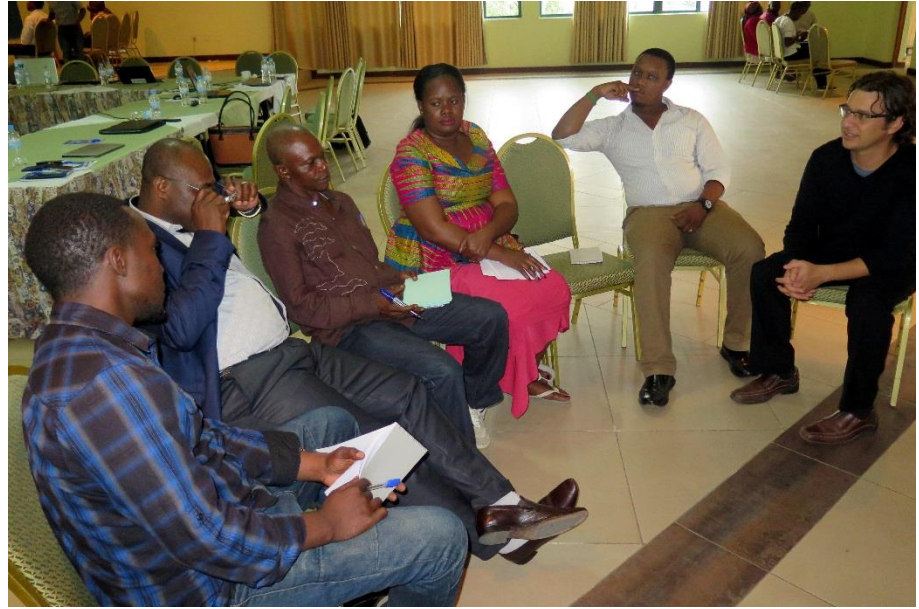
Planning workshop breakout sessions, Goma, DRC.

While a work in progress, we have synthesized the broad steps for scenario analysis and drafted some best practice guidelines for ensuring planning activities are useful and relevant to the stakeholder needs (Table 1). These currently guide the methodology in each case study and will be adapted as they are tested.