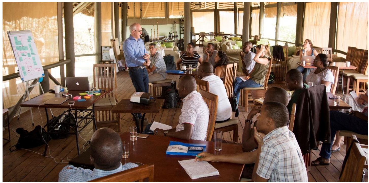
Participants at the November 2017 African Leadership Network at Lake Burunge Tented Camp, Tanzania where Maliasili Initiatives and The Nature Conservancy brought leaders from eight local conservation organizations, based in Kenya, Tanzania, and Namibia, together to participate in a firstof-its-kind leadership training.