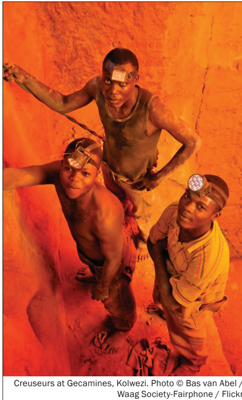
Creuseurs at Gecamines, Kolwezi.

Canadian mineral companies are commonly targeted by protesters in Canada and around the world accusing them of causing environmental damages, violating human rights and creating poverty. 4 A recent study commissioned by a mining industry association revealed that one-third of the 171 reported violations of corporate social responsibility between 1999 and 2009 implicated companies that are registered and listed in Canada. 5