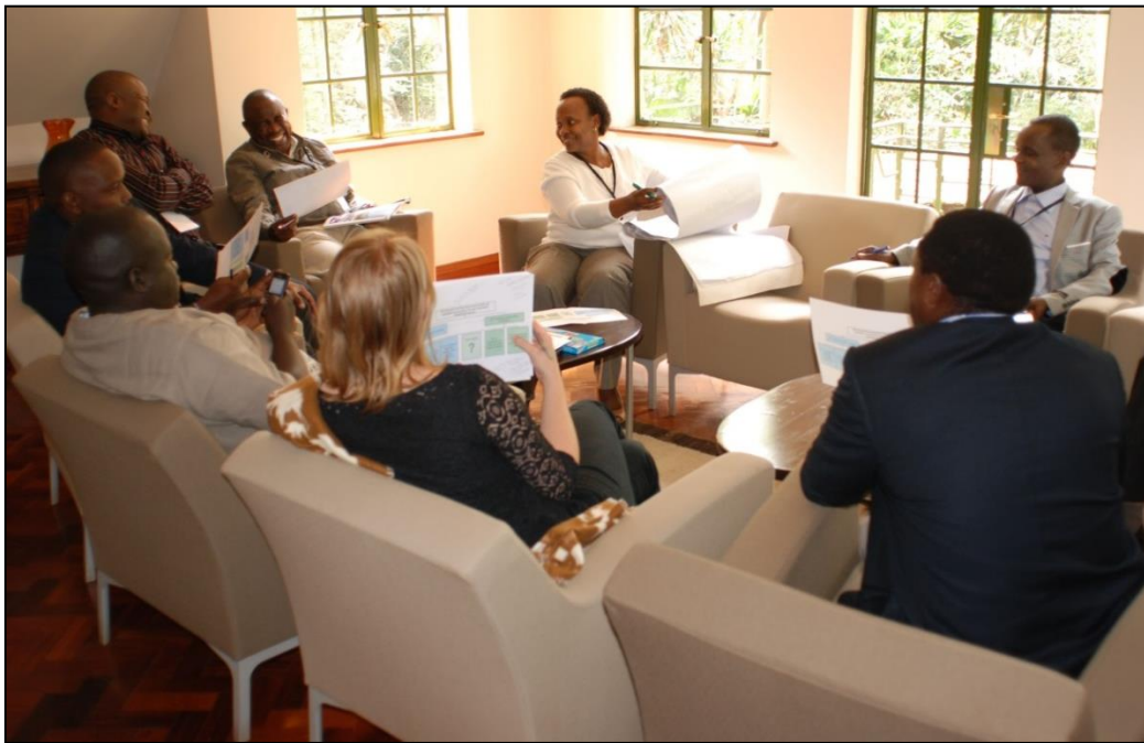
The freshwater conservation sub-group works on standardized indicators

The WASH subgroup noted that it would be helpful to include a goal statement in the framework and suggested incorporating improved governance of water resources as an additional Intermediate Result. They emphasized the importance of measuring both access and use of sanitation facilities, as the presence of functioning facilities in a community does not guarantee that they are being used by community members. In plenary, both sub-groups presented their recommendations to the larger group and changes were made to the Results Framework when the group reached consensus.