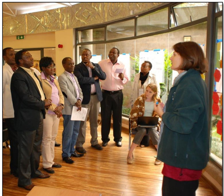
Group reviews value-added indicators

The group reconvened in the afternoon to allow the sub-groups to present their work. It is important to note that during this time three participants decided to form a working group to tackle the Results Framework. Throughout the workshop, participants continued to challenge causal links in the Results Framework and whether it supported the level of integration desired. This discussion carried into Day 3 and resulted in several revisions of the draft Results Framework.